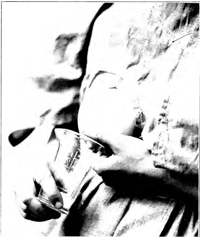
EXPRESSION OF BREAST MILK.